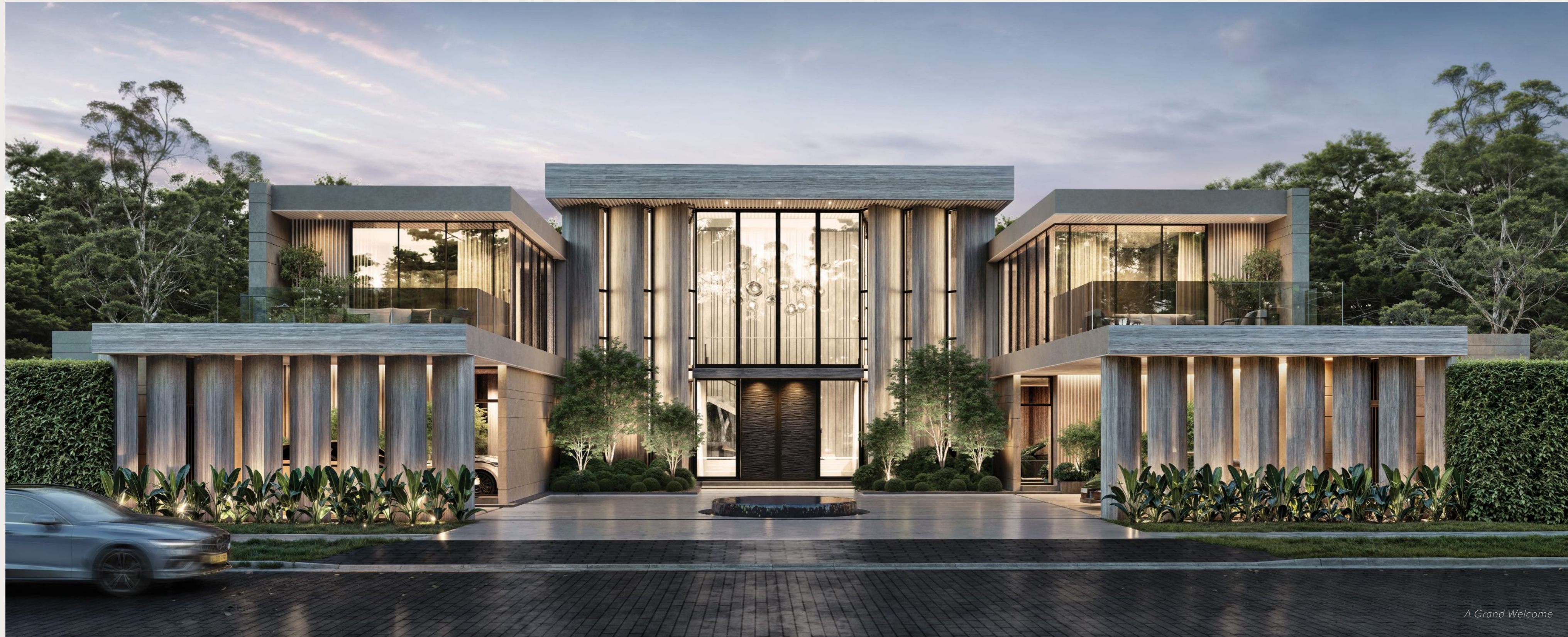
A Grand Welcome