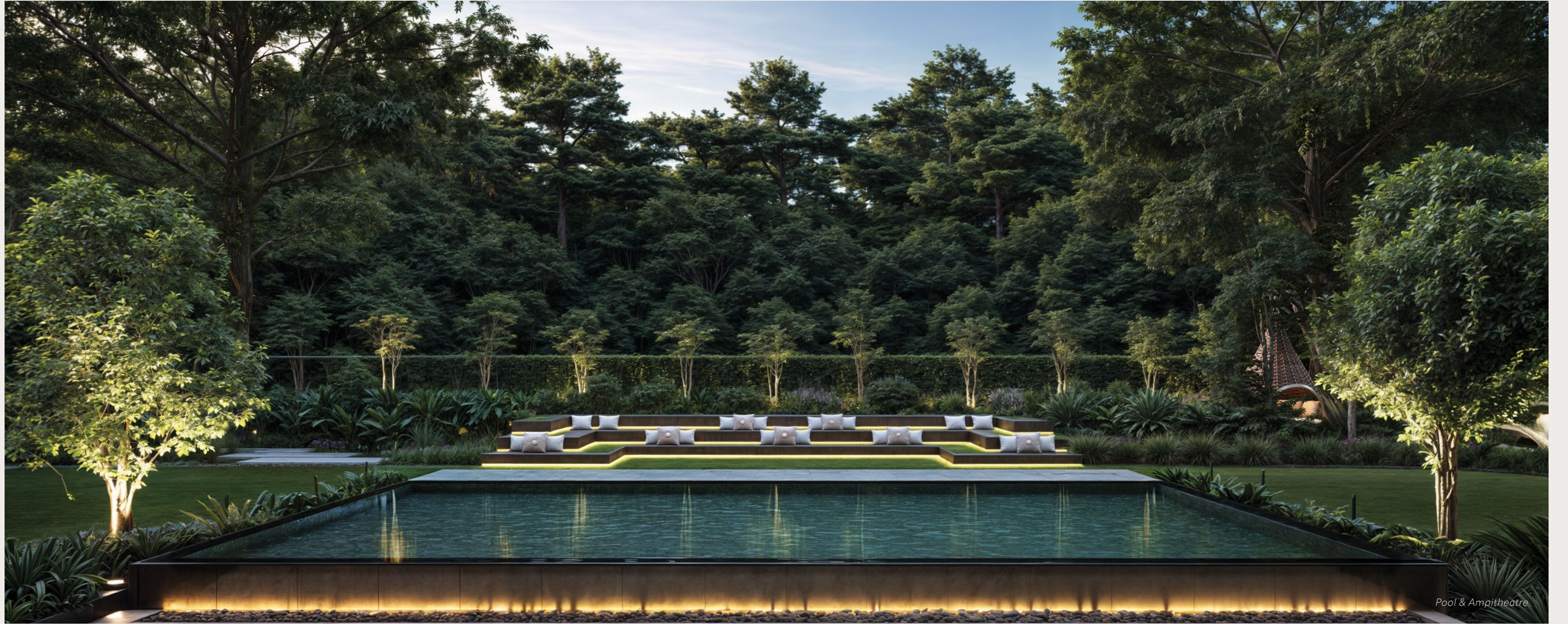
Pool & Ampitheatre