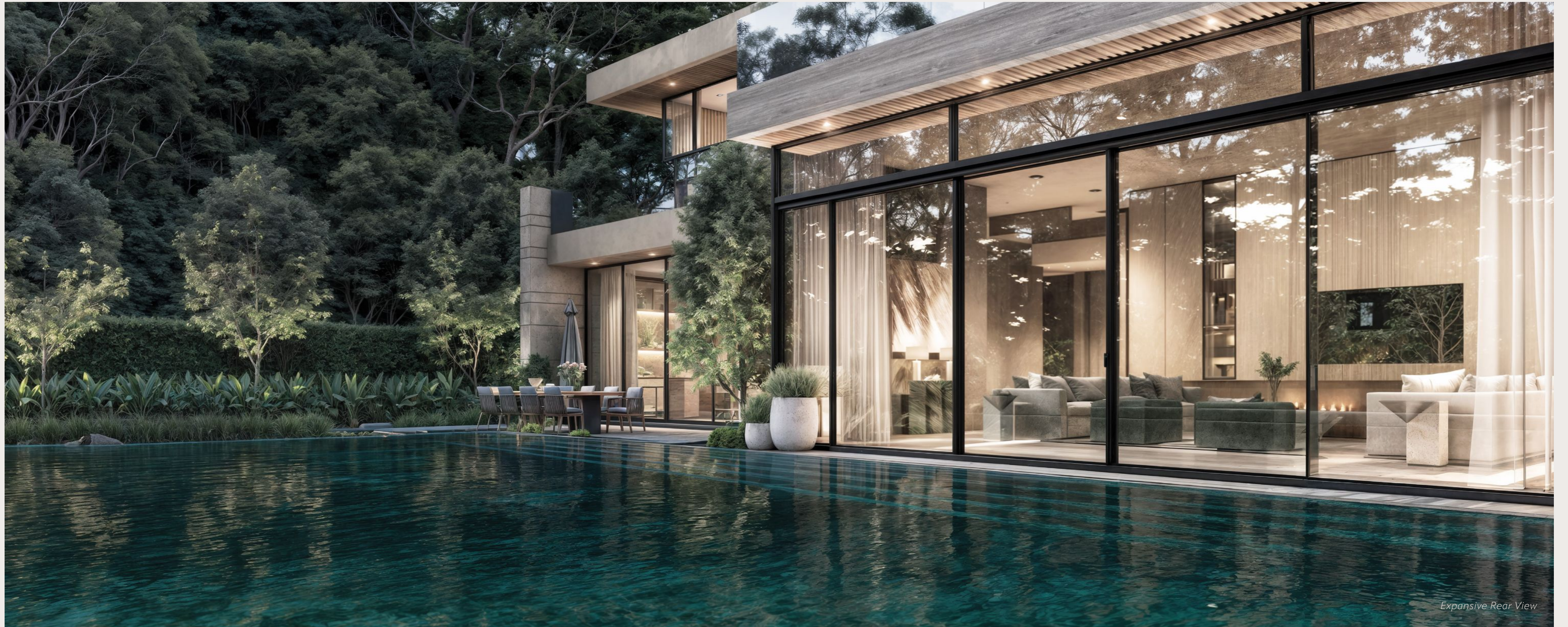
Expansive Rear View